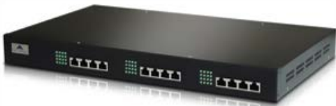
OM80 30~100 extensions