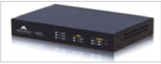
OM20* 0~20 extensions