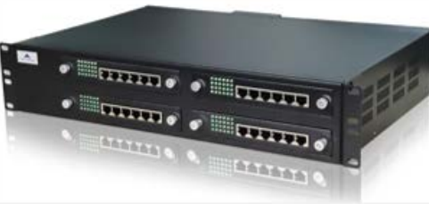
OM200 100~200 extensions

*The OM20/OM50 are enhanced models available with NetGen Communications patented Smart FoIP®.