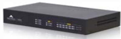
OM50* 20~60 extensions